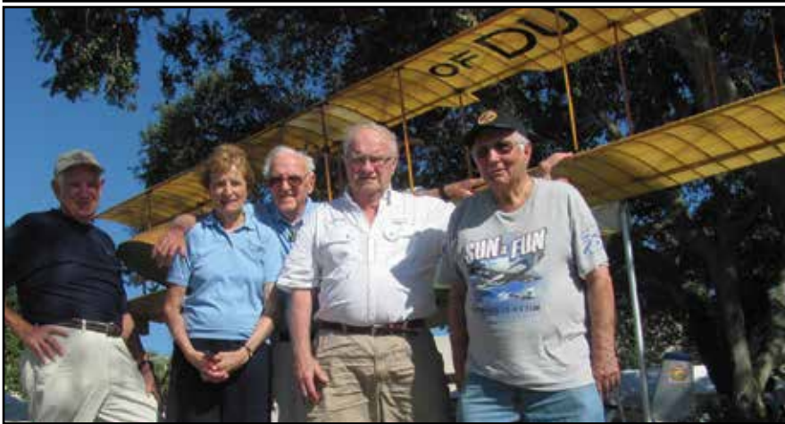
Volunteered at our Benoist display at the University of South Florida Science Fair.